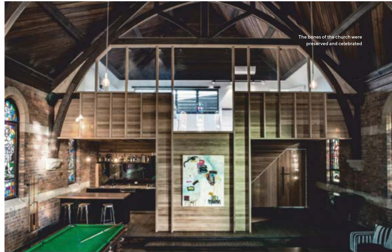
The bones of the church were preserved and celebrated