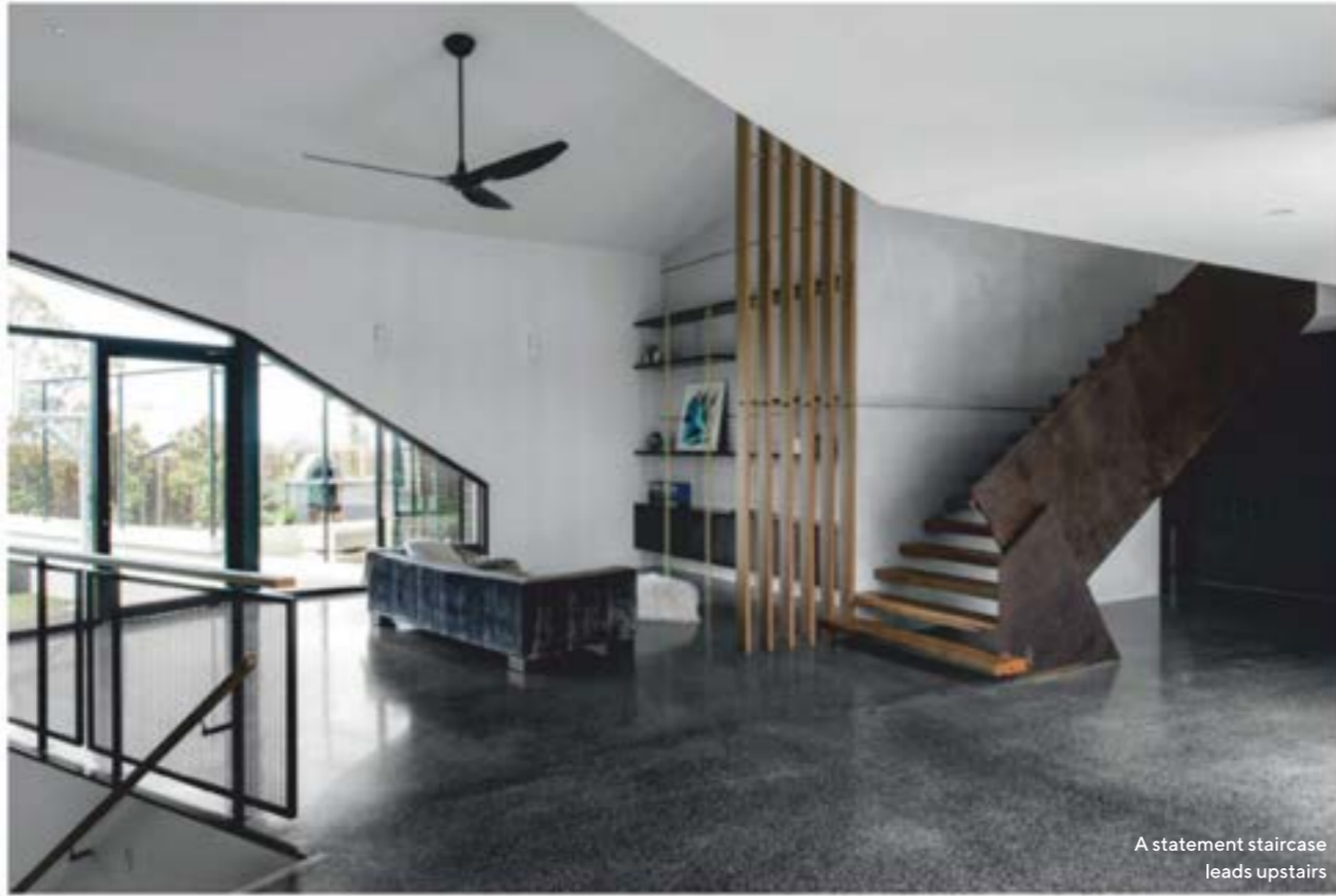
A statement staircase leads upstairs