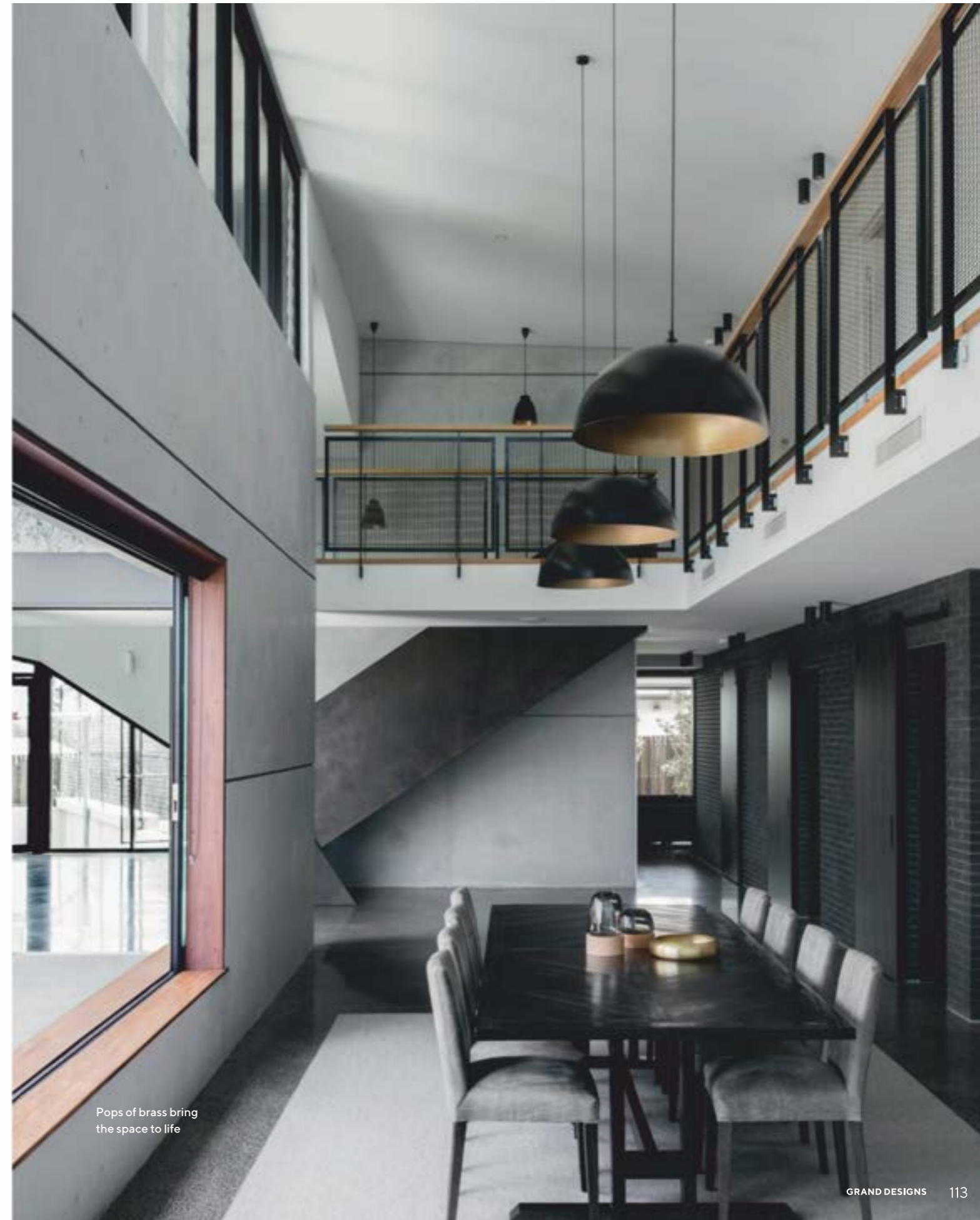
Pops of brass bring the space to life