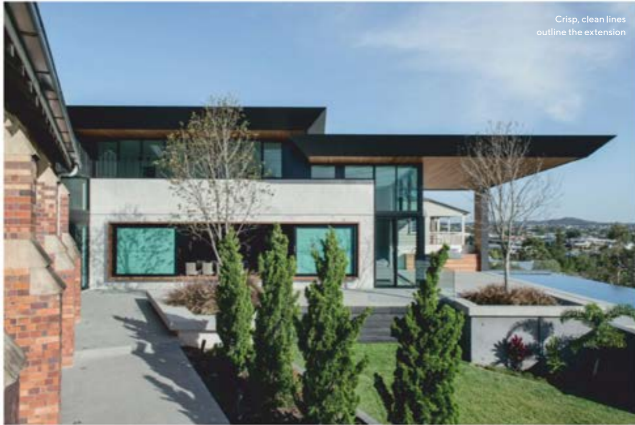
Crisp, clean lines outline the extension