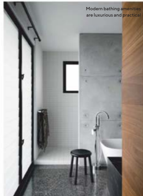
Modern bathing amenities are luxurious and practical